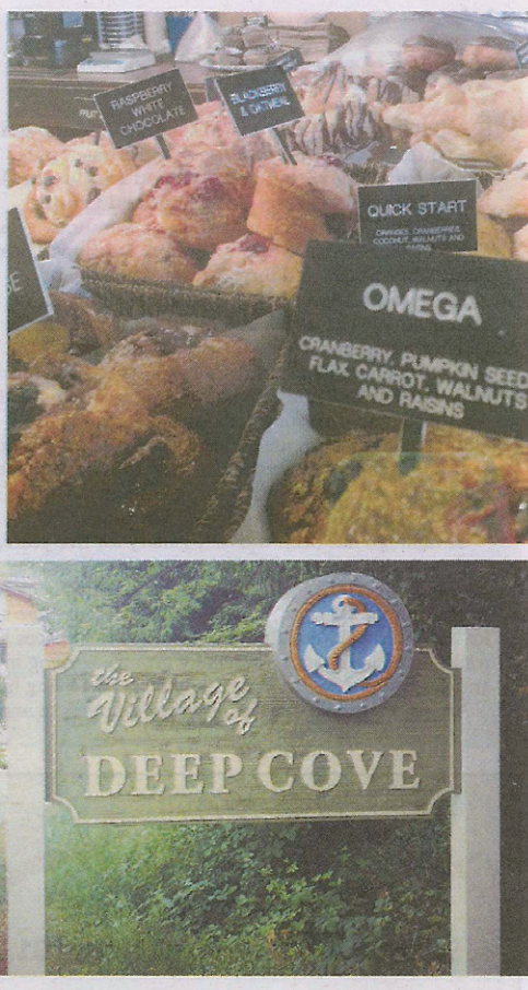
See page 20 Deep Cove features distinctly West Coast vibes along with stunning scenery, a vibrant arts scene, and good eats.